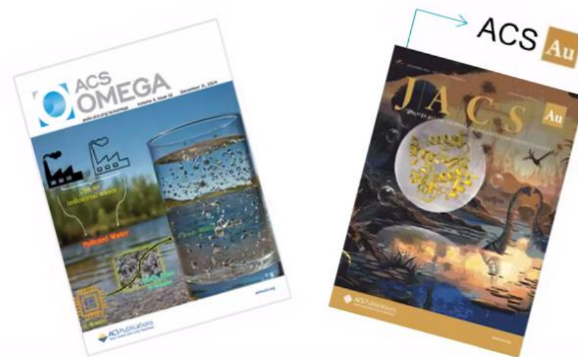
Fully Open Access